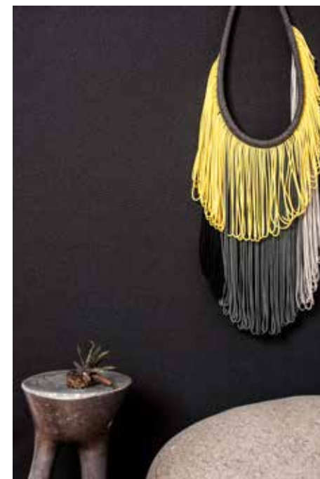
Both images: Elodie Blanchard's collection for HBF Textiles: crisp, fresh patterns inspired by nature, bring the outdoors in.