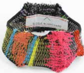
Growing out of Scrap, bracelet