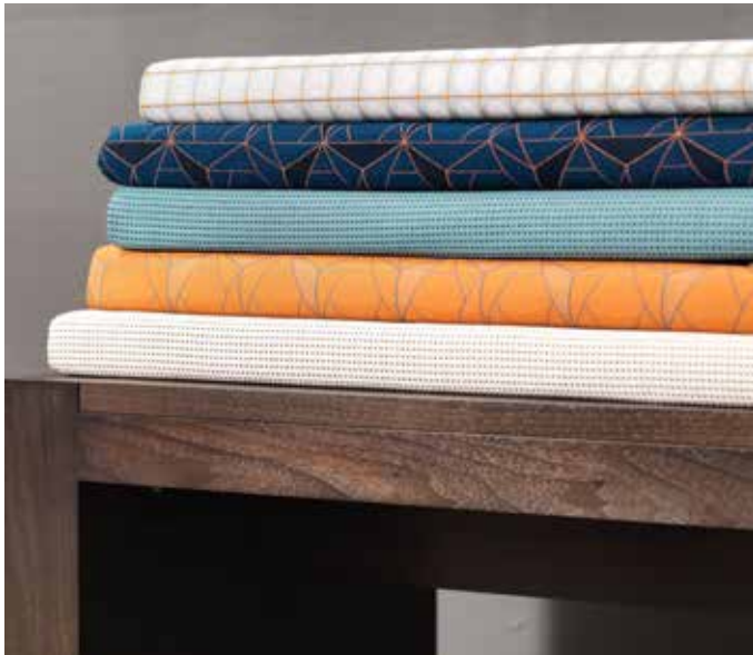
Clockwise, from above: three details of the timeless and minimal geometric patterns that make up the collection for HBF Textiles.